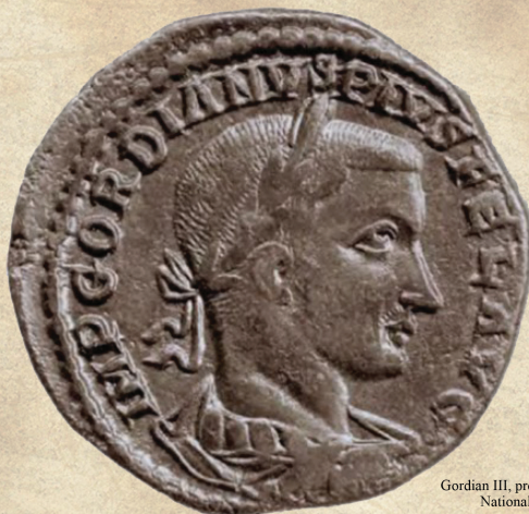
Gordian III, provincial mint of Viminacium National Museum in Belgrade